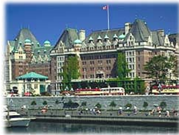
The Fairmont Empress Hotel, Victoria, BC

As well as the exciting Conference preparation, the Chapter continues with our core activities of monthly luncheons, student paper competitions, a scholarship award and a seasonal social.