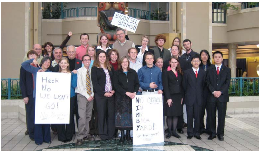
Environmental Challenge 2006 Participants