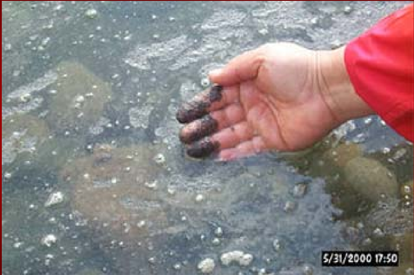
Slag floating near Northport